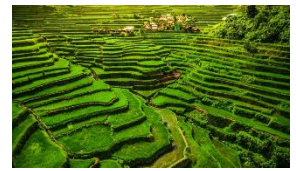
IFUGAO HERITAGE SITE